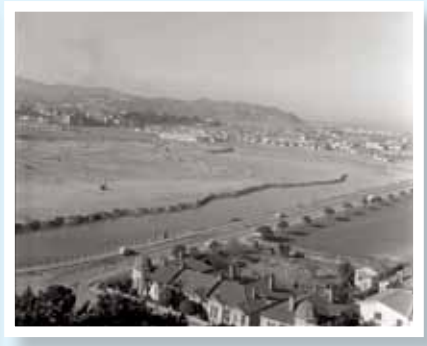
Reclamation of the foreshore underway