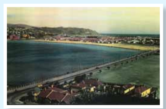
Early 1950's view of the current College site as sea prior to the reclamation. Note the adolescent pothutakawas along Kilbirnie Park on Evans Bay Parade.

Below: A triptych of the current College site before it was built, with all three photos taken from the same angle.