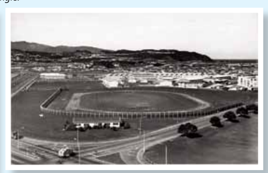
Early 1970's – this site was for the local athletics track prior to the College being built