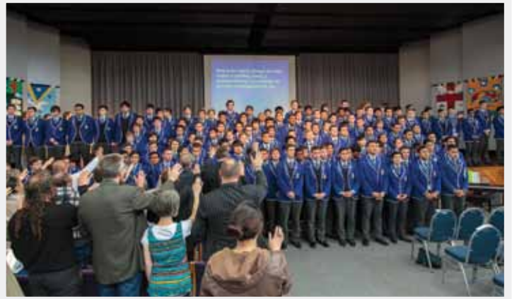
ABOVE: 2012 Leavers each presented with their Old Boys' tie.

We are very fortunate that the Council agreed to participate in this