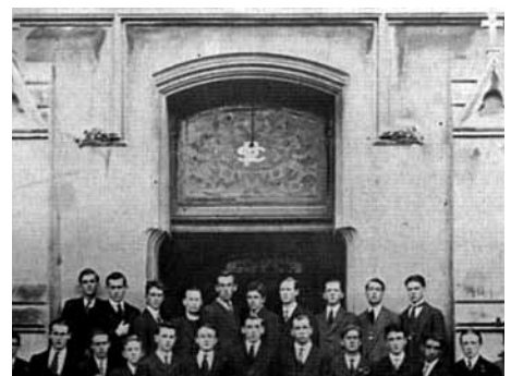
PICTURED CLOCKWISE FROM TOP LEFT:

1902 front door; 2014 view from the Quad; 2014 'in situ' in the Watter's entrance; 1909 front door with the new window.